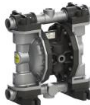
ALU (P 160)